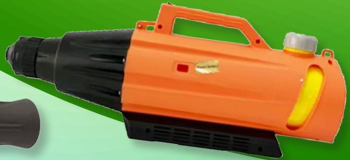
110V WITH CORD